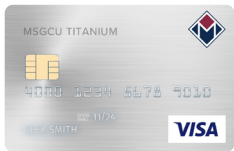
Titanium Visa: 9.75% APR*