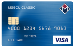
Classic Visa: 12.75% APR*